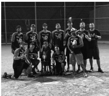
2020 Men's League Champions— Riley's Bar & Grill

*Interested in umpiring any Adult Softball Leagues? Contact our department. $25/game and paid training.*